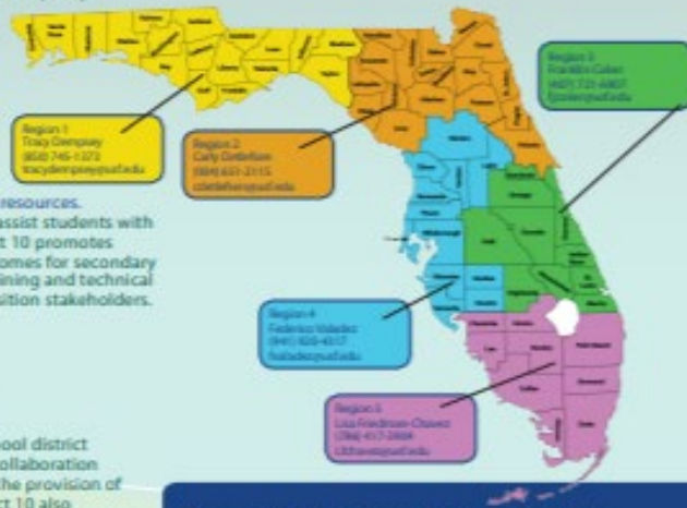
Regional Transition Representatives

Project 10 provides training and technical assistance to Florida schools and districts regarding the effectiveness of using student data and early warning indicators to identify students who may be at risk of not graduating. The Project 10 Early Warning System (EWS) uses a process that increases high school graduation success by assisting school personnel to identify individual student needs and implement strategic interventions.